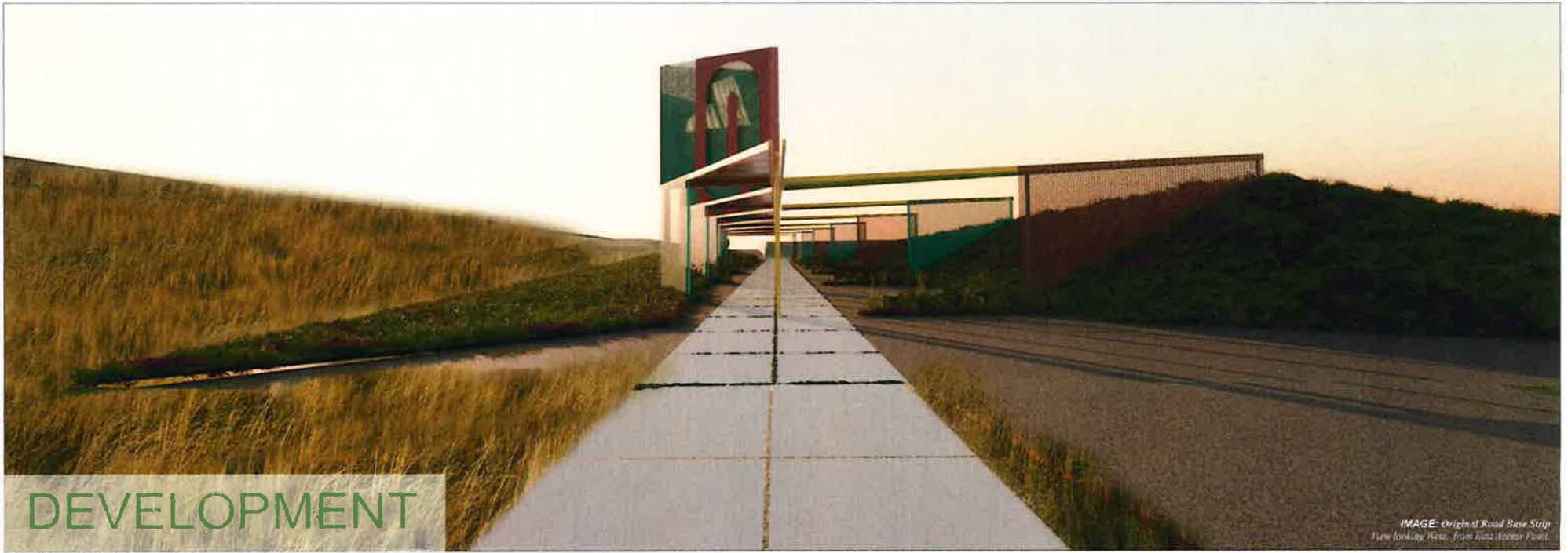
IMAGE: Original Road Base Strip New Lookage / Rest / Free Zone Access Point