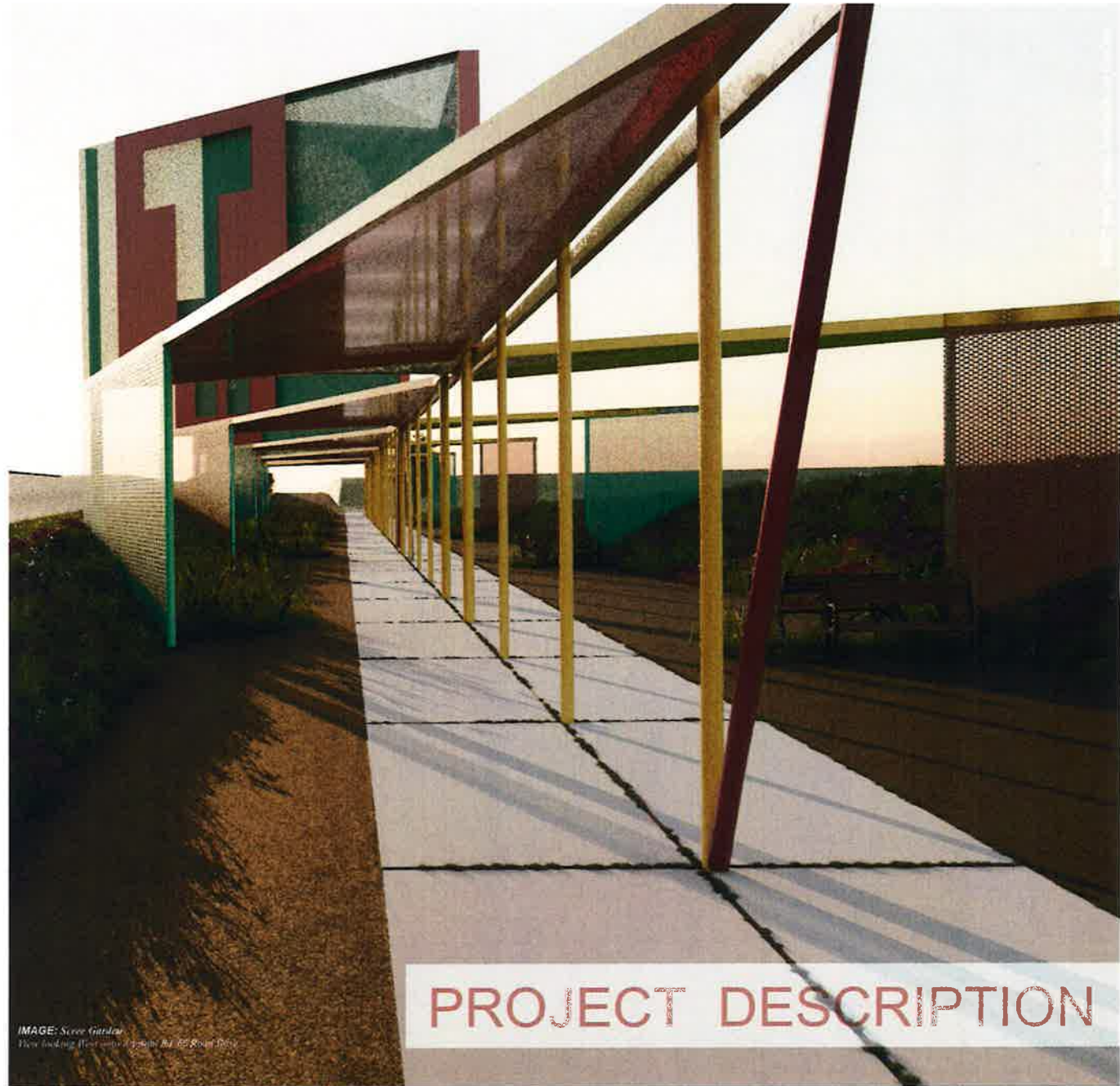
IMAGE: Scree Garden View looking West from a point on RT 66 Road Base

This preservation effort will serve as a bridge to the past, fostering a deeper connection between the community and visitors.