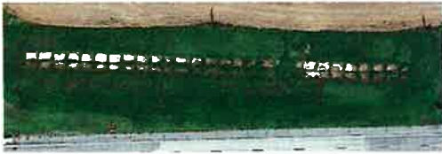
IMAGE: Original RT 66 Road Base OVH View