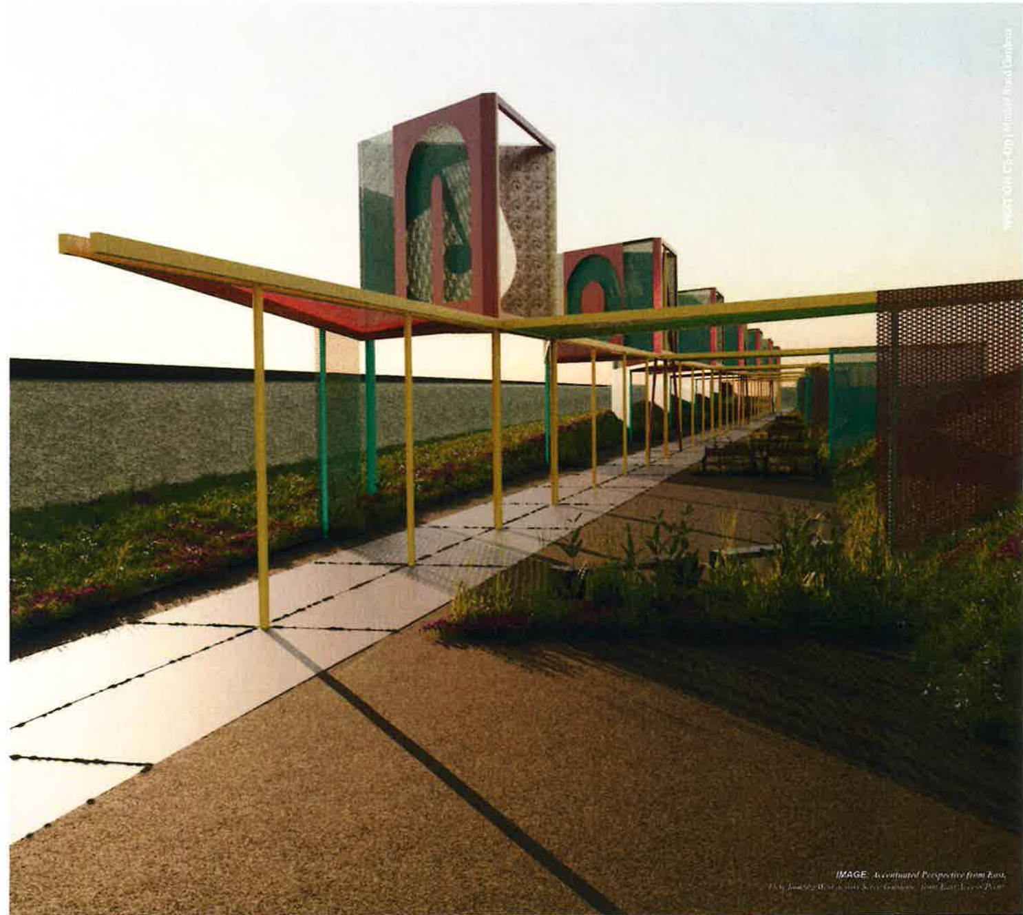
IMAGE: Accentuated Perspective from East, View looking West across Seven Gardens, from East Access Point.