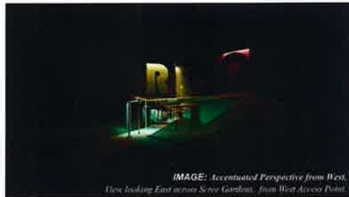
IMAGE: Accentuated Perspective from West, View looking East across Seven Gardens, from West Access Point.

Immersive Recreation: Interactive and recreational elements will be integrated, offering a novel draw for visitors and enhancing the overall experience.