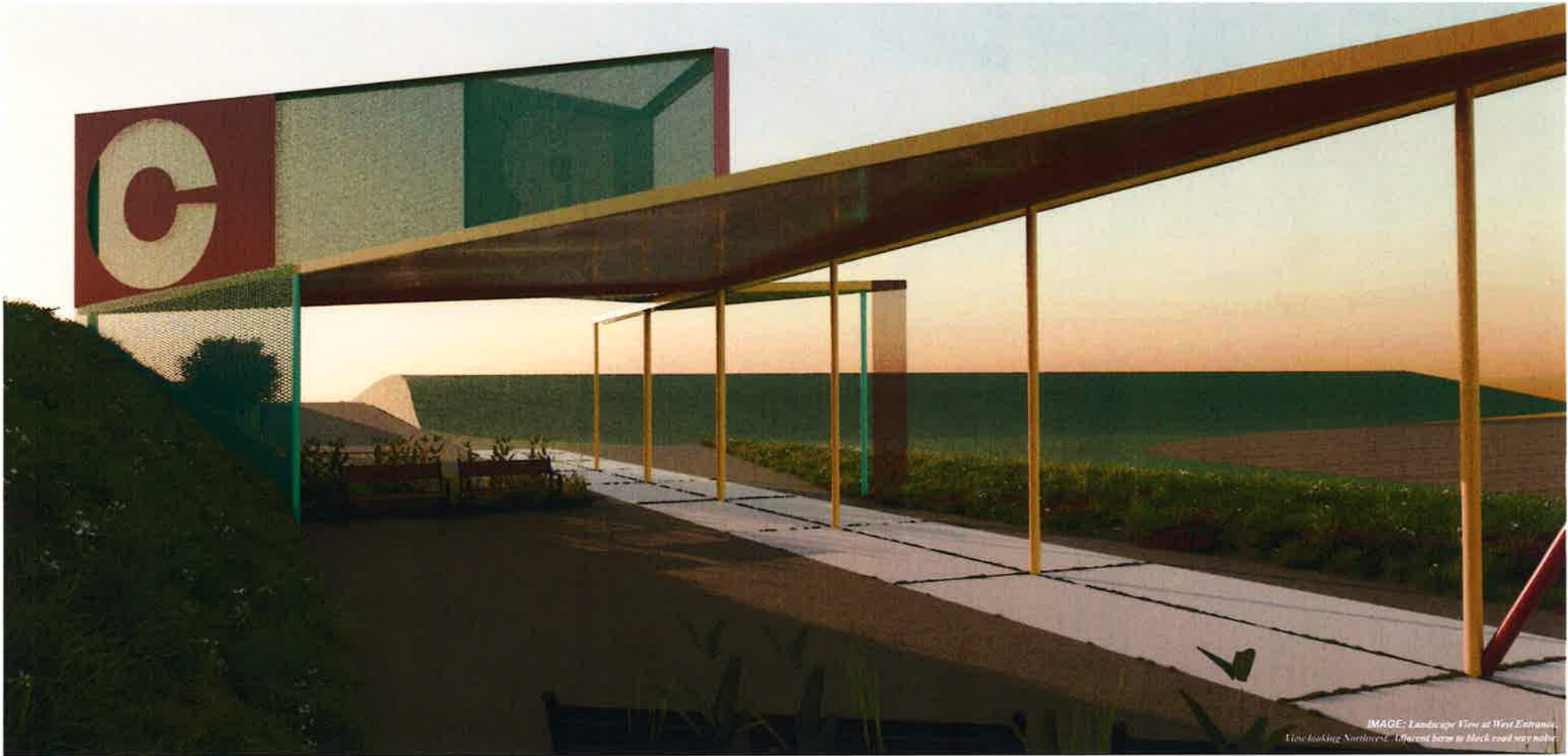
IMAGE: Landscape View at West Entrance. View looking Northwest. Apparent horizon to Mock road way north.